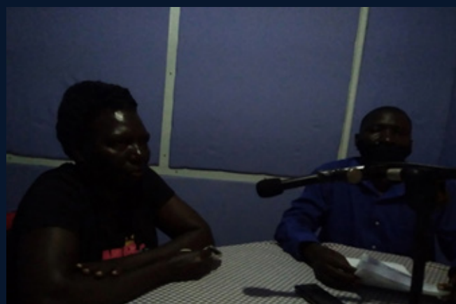
UWEP on Radio Christ the King at Gili Nebbi District