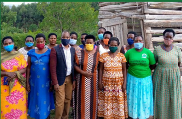
Rwobuziizi TC Women Tuhwerane Milling

The funds received under UWEF programme have helped the group members to educate their children by a way of acquiring soft loans from the profits got from the project. Out of the profits generated from the project, each member was given 10 chicks as a startup capital for their gains.