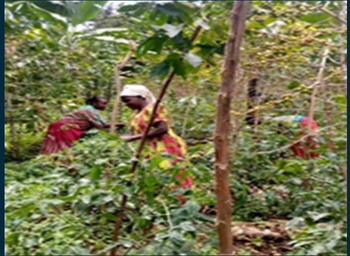
Rwandet women group doing Coffee