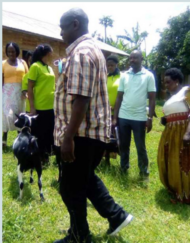
RDC, DISO, production officer, chairperson women council and FPP monitoring Nyabitojo women group