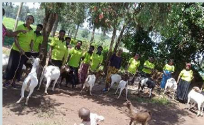
FPP appreciating Nyabitojo group members for being active and payback government support on time

The women in the group started up other businesses such as Bee keeping where each member owns bee hives in her home. They also have an apiary house which encloses 28 bee hives from which they sell honey as a group to earn income. This group also has a savings and credit initiative where all the members are involved.