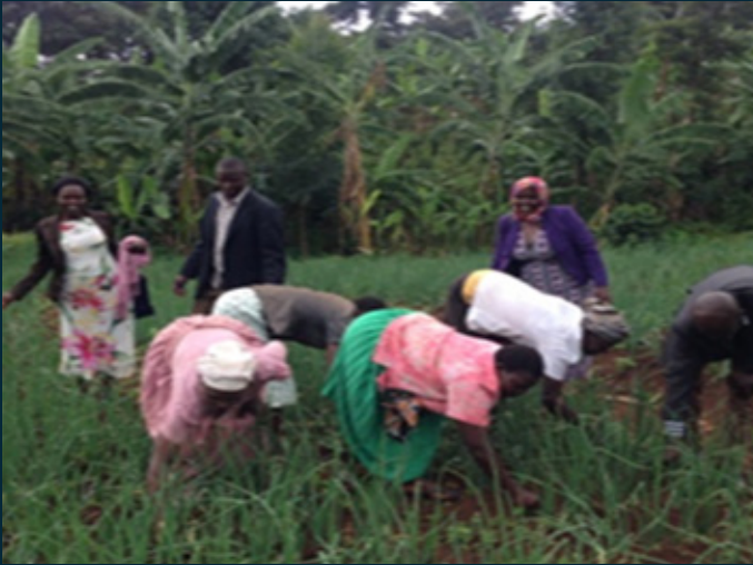
Rwandet women group doing onion farming