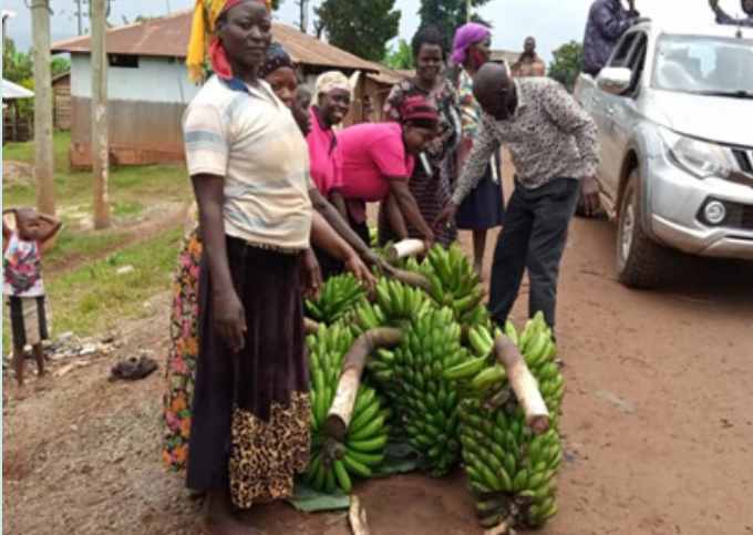
Chemwenon Women Group selling Matooke

A vote thanks goes to the Government of Uganda through UWEP under Ministry of Gender Labour and Social Development.