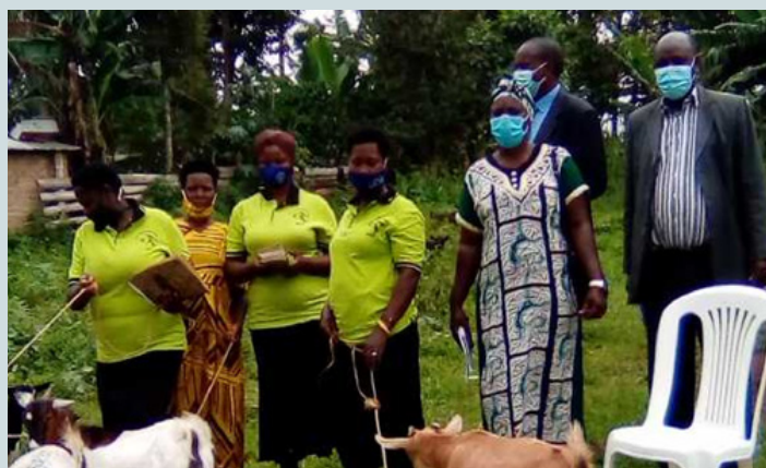
The CAO, district chairperson and secretary CBS Kyenjojo district monitoring Nyabitojo women group