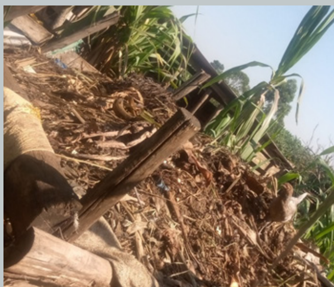
Garbage collection centre in preparation to make farm yard manure