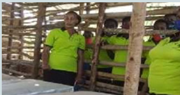
Apiary house for Nyabitojo women group, as addition source of income